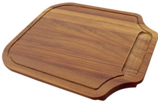
Iroko-wood chopping board 8655 000